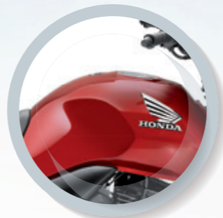
Imperial Red Metallic