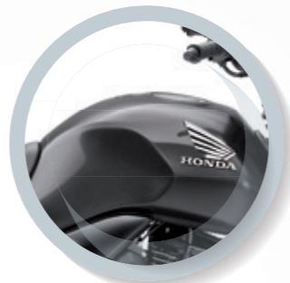
Mat Axis Gray Metallic