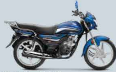
Athletic Blue Metallic