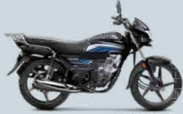
Black with Blue