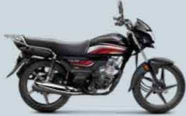
Black with Red