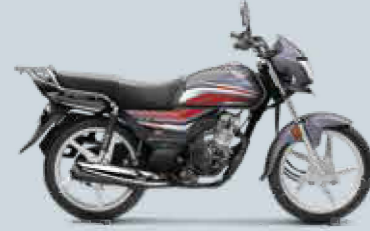
Geny Grey Metallic