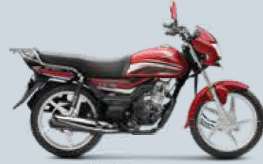
Imperial Red Metallic