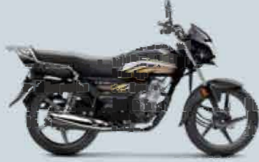
Black with Cabin Gold