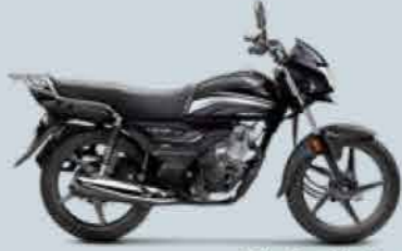
Black with Grey