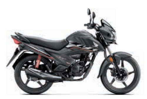
MATTE AXIS GRAY METALLIC