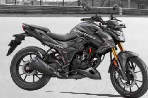
MATTE AXIS GREY METALLIC