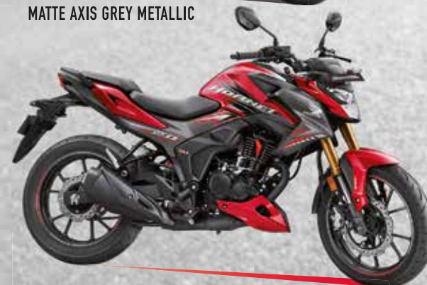
MATTE SANGRIA RED METALLIC

BOOK ONLINE NOW! www.honda2wheelersindia.com